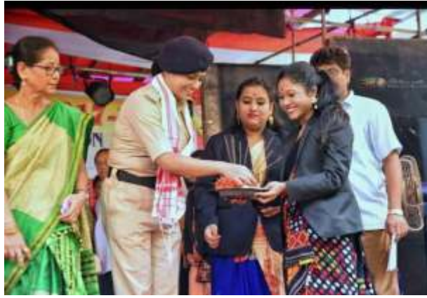
Inauguration of College Megazine “Tonaya”